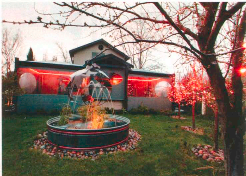
Willi's Wine Bar in Santa Rosa draws residents and tourists alike with its casual ambience.

The tables are laid out in a chockablock pattern with a grouping by the entrance and some tucked back into a nook at the back of the 14-seat wine bar, under a copper-panel ceiling. The largest seating area is around the front side of the bar, a relic from the Orchard Inn. The building that houses the restaurant was built in 1886 and still has that kind of clandestine feel that harks back to a previous incarnation as a rough-and-tumble bar.