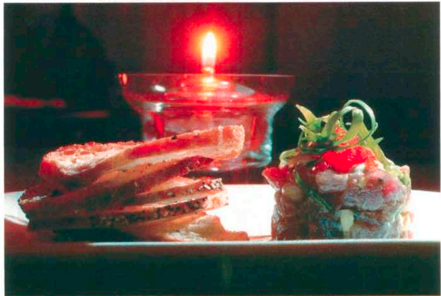
Ahi tuna tartare with lemon, chiles and pine nuts.